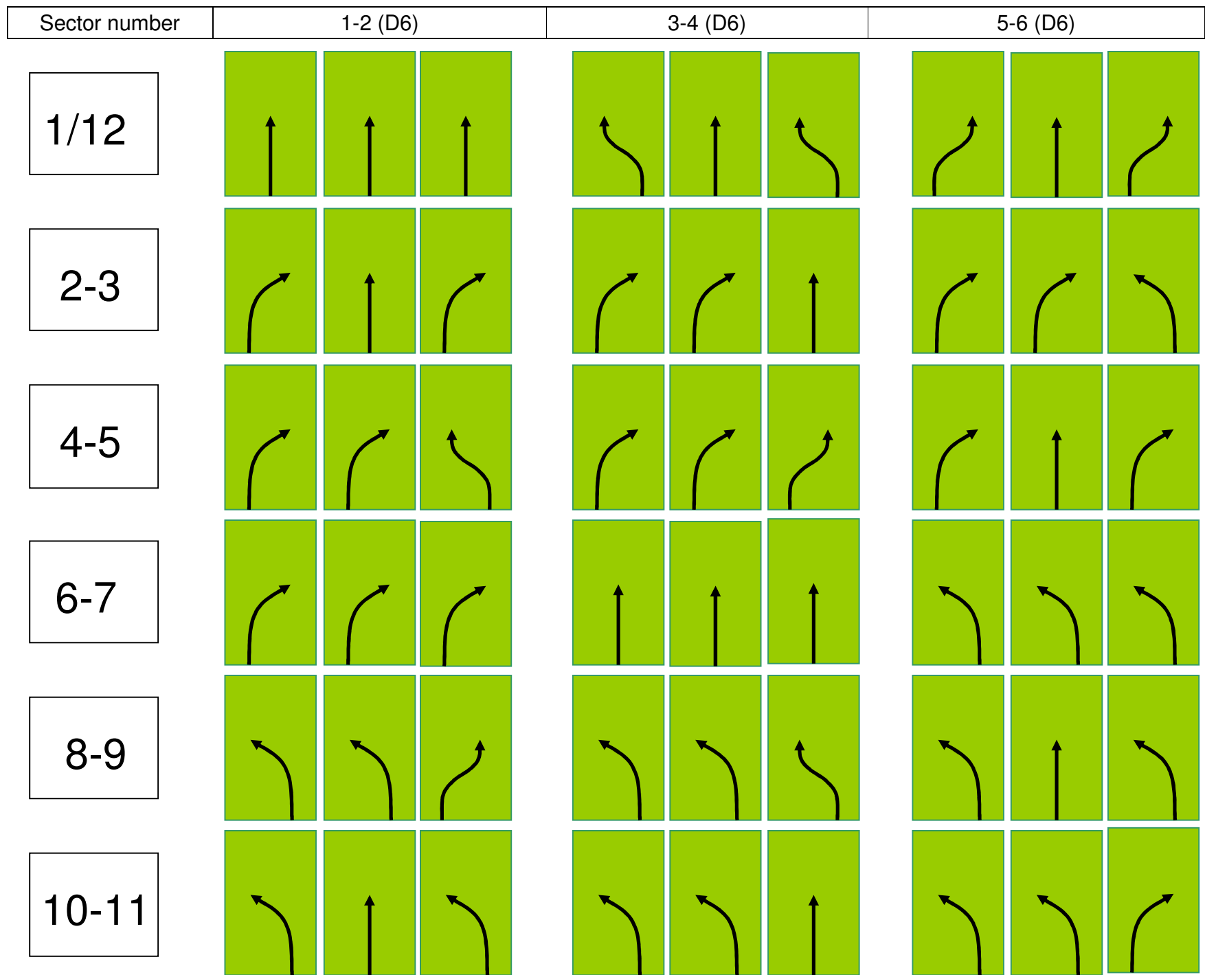
Manoeuvre deck Y